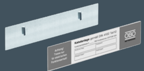
7205400 GR-KS FS Label holder for mesh cable trays 252 x 45 mm